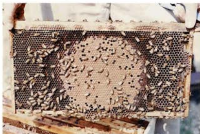
Figure 1. Comparing healthy brood to AFB-infected brood

1. A healthy brood pattern. Pupae lie next to other pupae with larvae around the outside because the queen lays eggs in expanding concentric circles. Note the good color and convex shape of the cappings over the pupae.