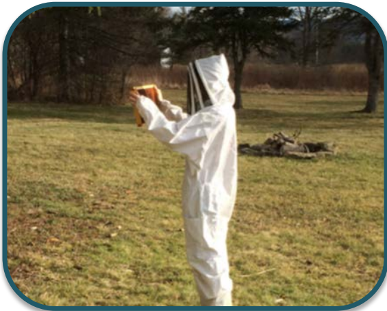
Figure 3. AFB-infected colonies must be destroyed through burning or deep burial. Hive tools and smokers can be sterilized with bleach water.

Figure 2. Inspect your brood frames 3 times a year to monitor AFB. Shake off bees and hold the frame so that the sun is shining directly into the brood cells for best vision.